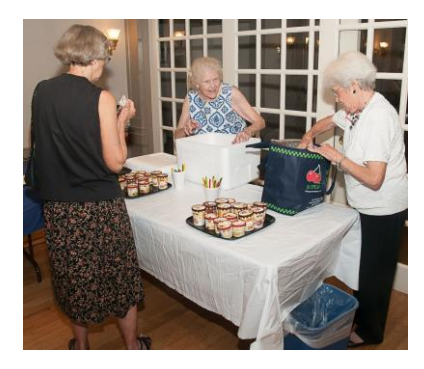
SETTING UP FOR JULY'S ICE CREAM SOCIAL